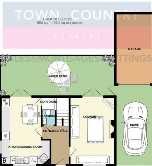
TOTAL FLOOR AREA : 1436 sq.ft. (133.4 sq.m.) approx.

Whilst every attempt has been made to ensure the accuracy of the floorplan contained here, measurements of doors, windows, rooms and any other items are approximate and no responsibility is taken for any error, omission or mis-statement. This plan is for illustrative purposes only and should be used as such by any prospective purchaser. The services, systems and appliances shown have not been tested and no guarantee as to their operability or efficiency can be given. Made with Metropix ©2024